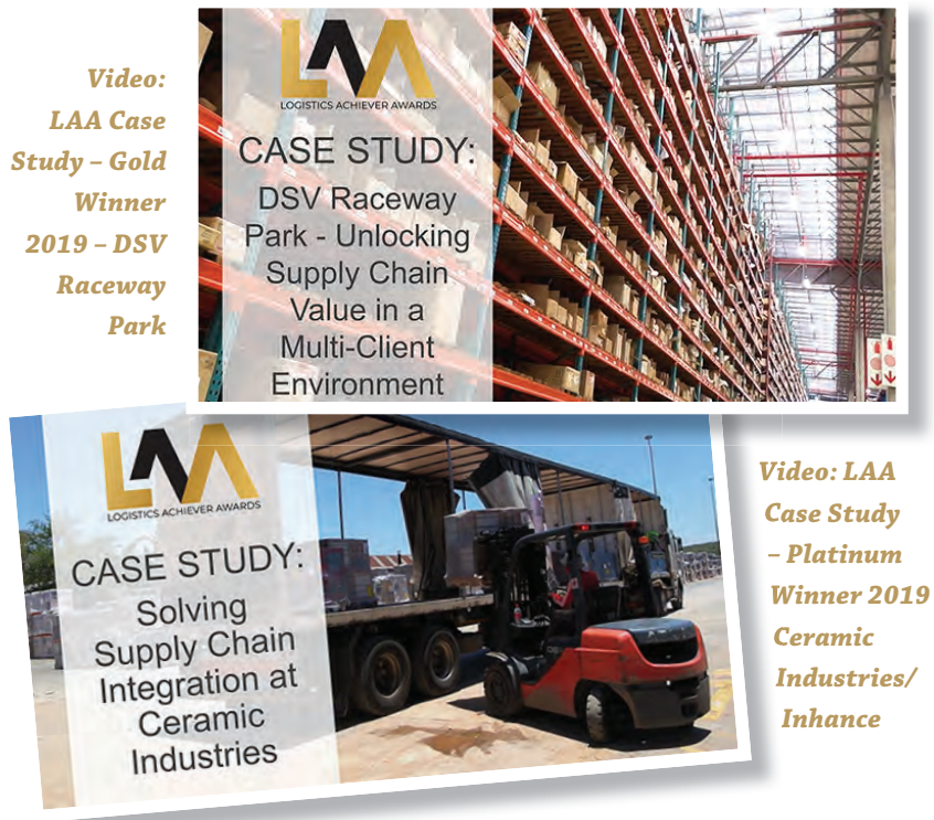
Video: LAA Case Study - Gold Winner 2019 - DSV Raceway Park

We have recently created two video case studies on past winners to share with the industry and thank DSV, Ceramic Industries and Inhance Supply Chains for their contribution: