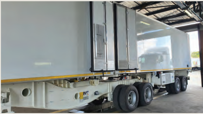
Serco has designed and used its engineering capabilities to build this refrigerated interlink trailer.